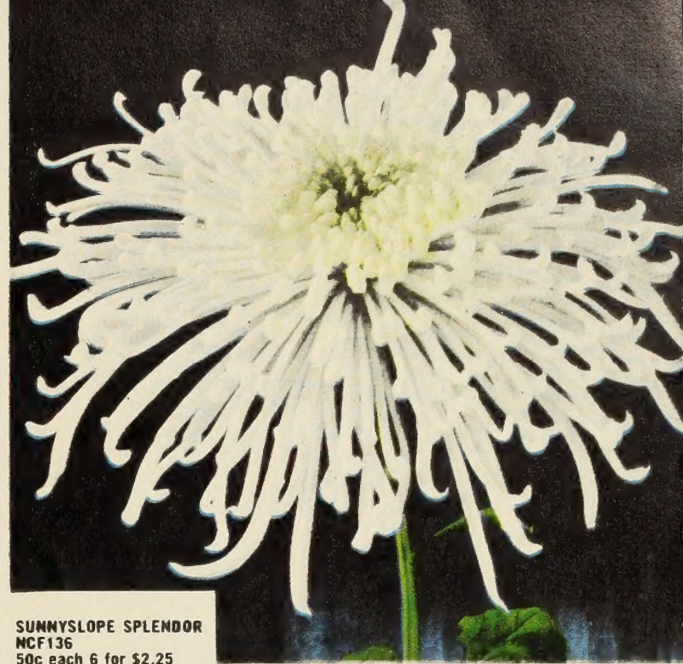
SUNNYSLOPE SPLENDOR NCF136 50c each 6 for $2.25

NCF144 YELLOW RAYONANTE — Beautiful yellow sport of "Rayon- ante".